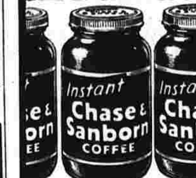
Backed by nearly 100 years of coffee experience!

When it comes to taste tryin' beats talkin'. You'll never know how good instant coffee can be until you try it.